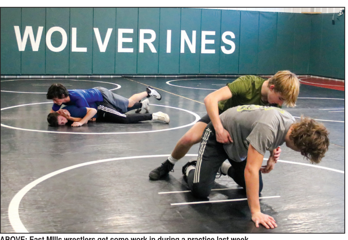
ABOVE: East MIIIs wrestlers get some work in during a practice last week.

LEFT: Glenwood players work on dribbling fundamentals.